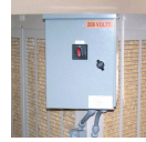
NEMA 3R BOX