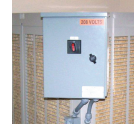
NEMA 3R BOX