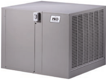
Down Discharge (PD Models)