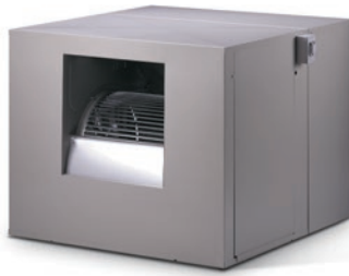
Side Discharge (PH Models)