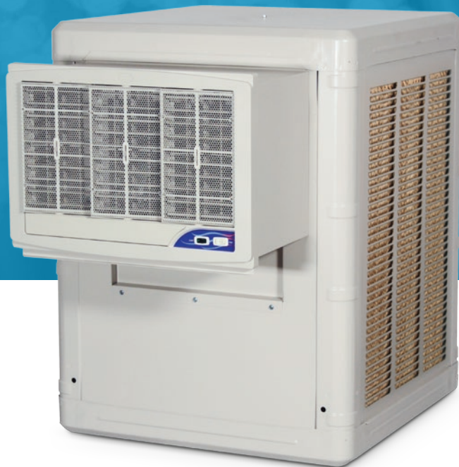
WCBW4000 Water Conservation Cooler

We created the Water Conservation Cooler to use as little water as possible while maintaining an output temperature within approximately 2 degrees Fahrenheit of a standard operating evaporative cooler. The Water Conservation Cooler works by keeping the pads just wet enough to cool without over saturating the pads and wasting water.