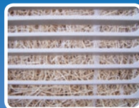
WITH The PowerClean System

The PDP allows you to customize the flush cycles to your exact cooler for optimum cleaning and allows for custom settings for both the dump frequency and time periods. Once placed in the water pan of your cooler, the Programmable Drain Pump will automatically cycle every 2,4,6 or 8 hours of cooler pump operation to empty the water within a few minutes. This cycle allows the cooler to re-fill with fresh water. At no time is cooling capability interrupted.