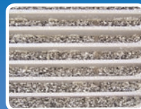
WITHOUT The PowerClean System