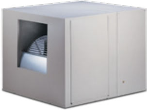
Side Discharge (TH, UTH, GH, HH Models)