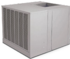
Up Discharge (TUP, UTUP, GUP, HUP Models)