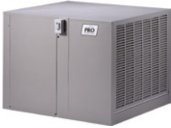
Down Discharge (PD & UPD Models)