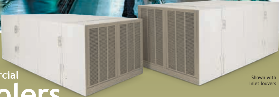
Shown with Inlet louvers

Energy Efficiency, Exceptional Performance